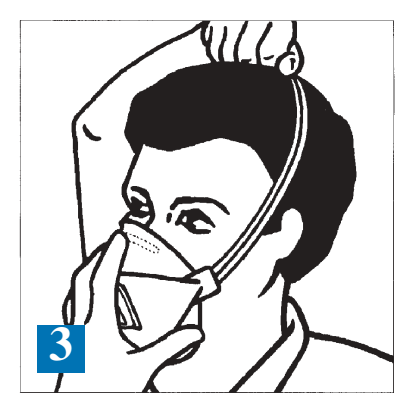
3. Cup respirator under chin. Ensure the two straps are seperated and pull the straps over the head.