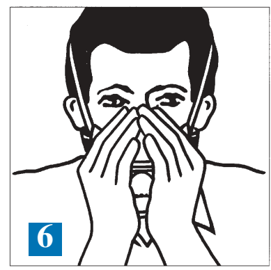
If you cannot achieve a proper fit do not enter contaminated area. See your supervisor.

6. The seal of the respirator on the face should be fit-checked prior to wearing in the work area.