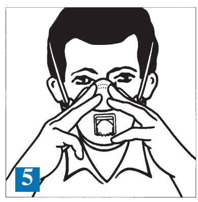
5. Using both hands, mould noseclip to the shape of the lower part of the nose. DO NOT pinch the nosepiece using only one hand as this may result in less effective respirator performance.