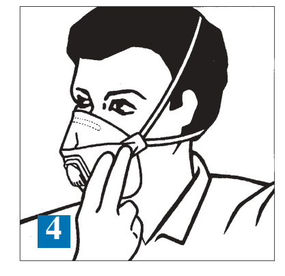
4. Locate the lower strap below the ears and the upper strap accross the crown of the head. Adjust top and bottom panels for a comfortable fit.